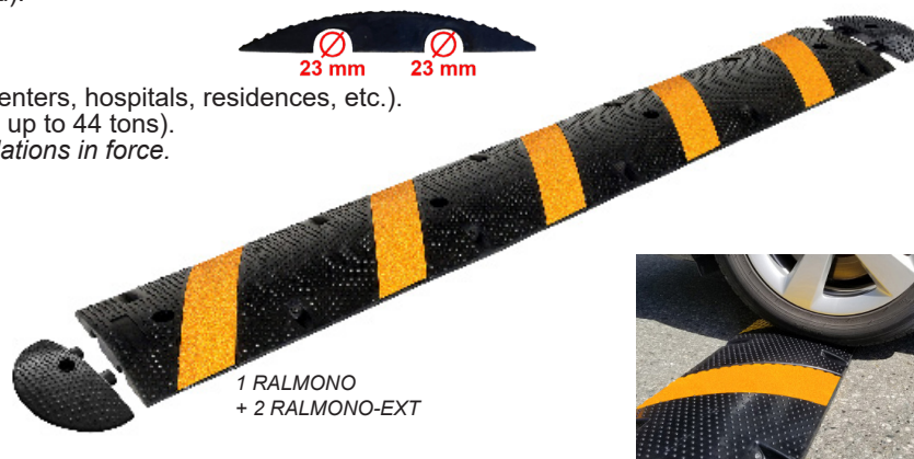
1 RALMONO + 2 RALMONO-EXT