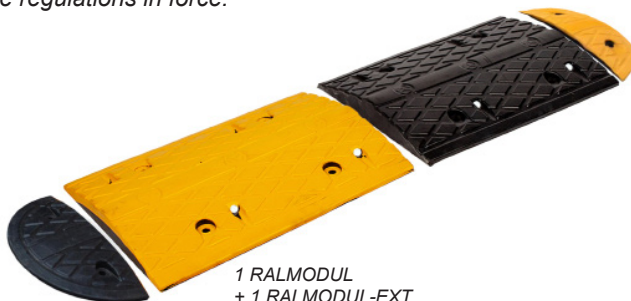
1 RALMODUL + 1 RALMODUL-EXT